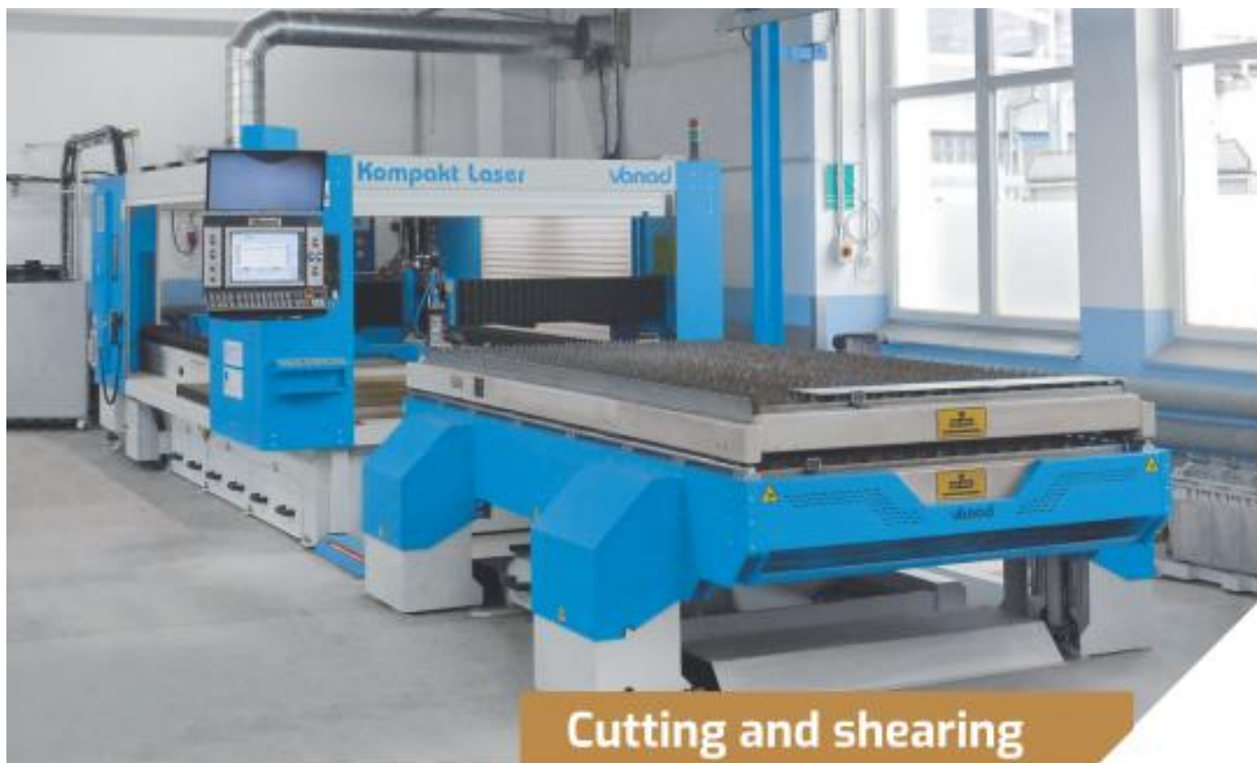
Cutting and shearing